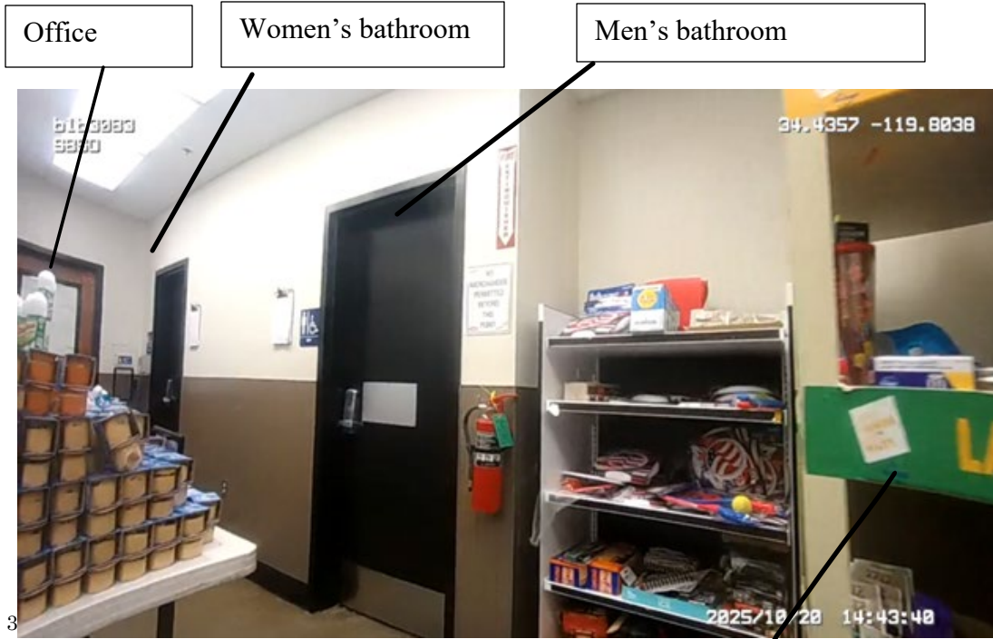
Shelves used to block doors